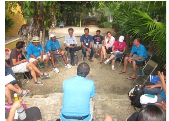
Exchanges Across Sites/Countries