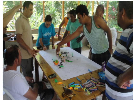
Participation & Leadership