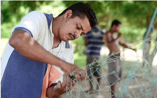
Community Identity & Wellbeing