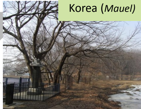
Korea ( Mauel )