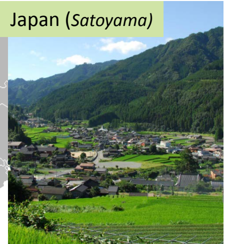
Japan ( Satoyama )