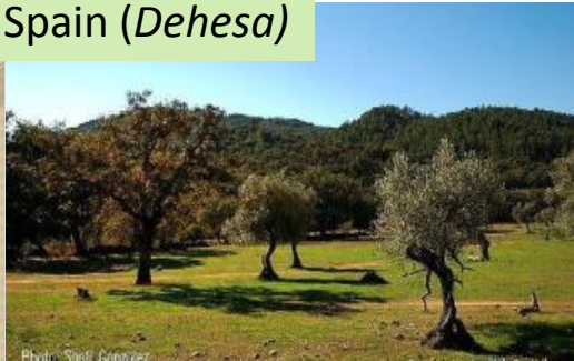
Spain ( Dehesa )